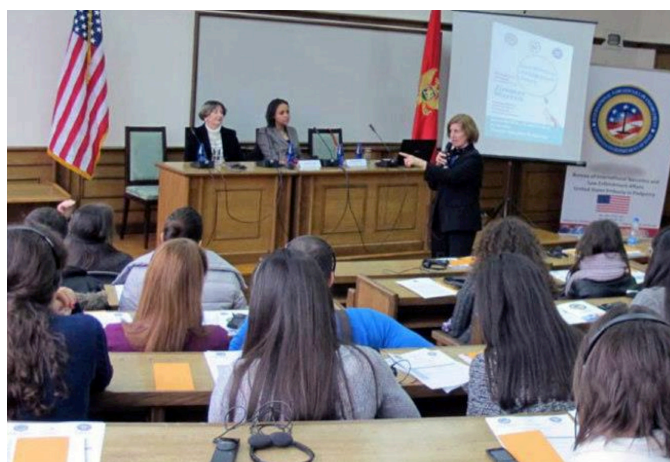
In cooperation with the Judicial Training Center in Montenegro and the Montenegro Bar Association, INL Montenegro hosted a former U.S. prosecutor to speak with law students about the U.S. judicial system with a focus on criminal investigations.

“The Bureau of International Narcotics and Law Enforcement Affairs is responsible for the development, coordination, and implementation of U.S. Government policy and programs directed at U.S. Government abroad on international criminal justice issues.” 1 FAM 531.1