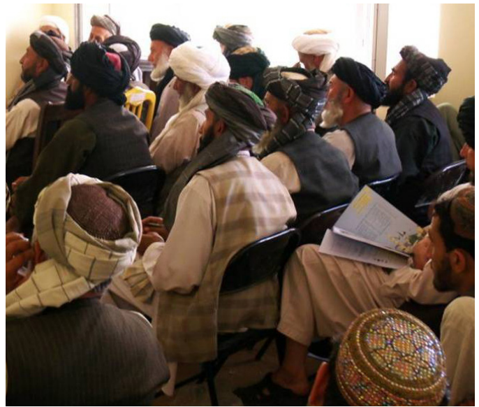
Afghan defense attorneys, judges, prosecutors, and criminal investigators took part in an 8-week INL-funded intensive legal training seminar, the Advanced Continuing Legal Education Afghanistan (ACLEA). INL's implementing partners provided ACLEA courses for legal professionals in all 34 provinces.

will likely include public interest and human rights organizations that serve dual purposes: monitoring compliance with the law and international standards and treaties; and advocating on behalf of those who have had their rights violated and/or are victims of crime. In some countries, civil society organizations provide counseling and mediation services, as well as legal assistance. Where there is political space to do so, these types of organizations often contribute expertise and input in consultative legal reform and legislative drafting processes. They also can generate and channel public demands to improve the effectiveness and accountability of the justice sector.