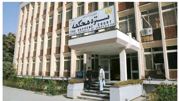
The INL-funded Justice Training Transition Program (JTTP) trains legal advisors at various locations including this court in Farah, Afghanistan. JTTP is helping to reconstruct the Farah justice building and court records, which were damaged during an insurgent attack. JTTP is also using INL funds to purchase and donate computers and other office equipment as part of the reconstruction effort.