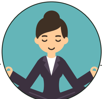
ADAPTATION & ACCEPTANCE