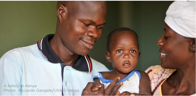
A family in Kenya

PEPFAR has saved over 18 million lives through accountable, transparent, and cost-effective investments