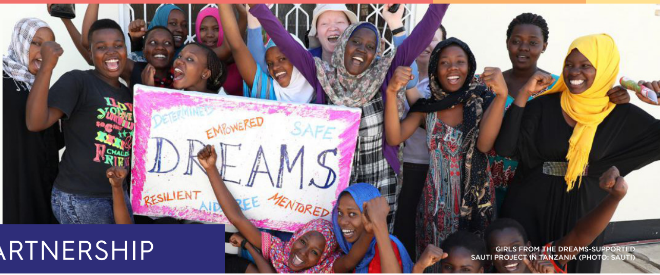
GIRLS FROM THE DREAMS-SUPPORTED SAUTI PROJECT IN TANZANIA

PEPFAR U.S. President's Emergency Plan for AIDS Relief