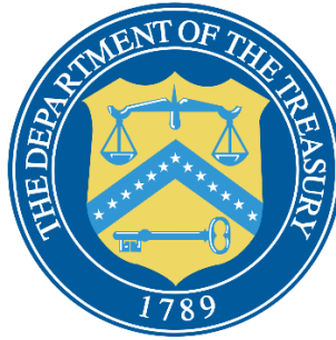
DEPARTMENT OF THE TREASURY