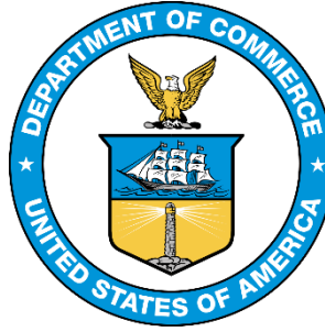
DEPARTMENT OF COMMERCE