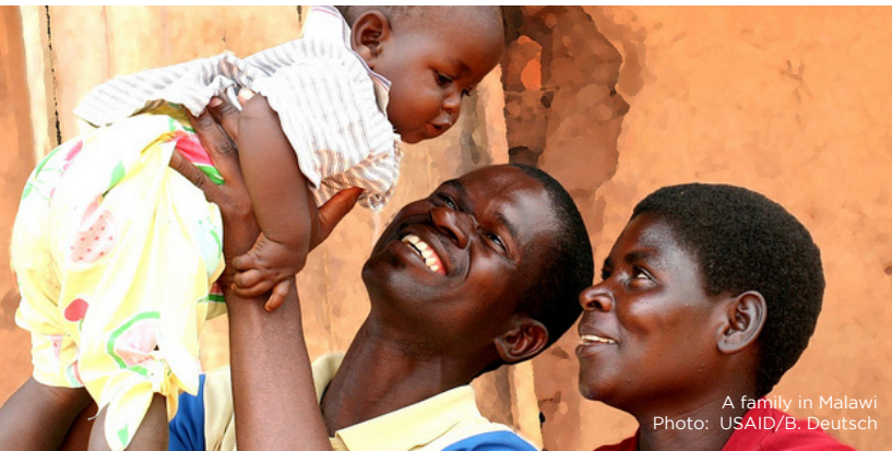
A family in Malawi

PEPFAR has saved 20 million lives and supported several countries to achieve HIV epidemic control