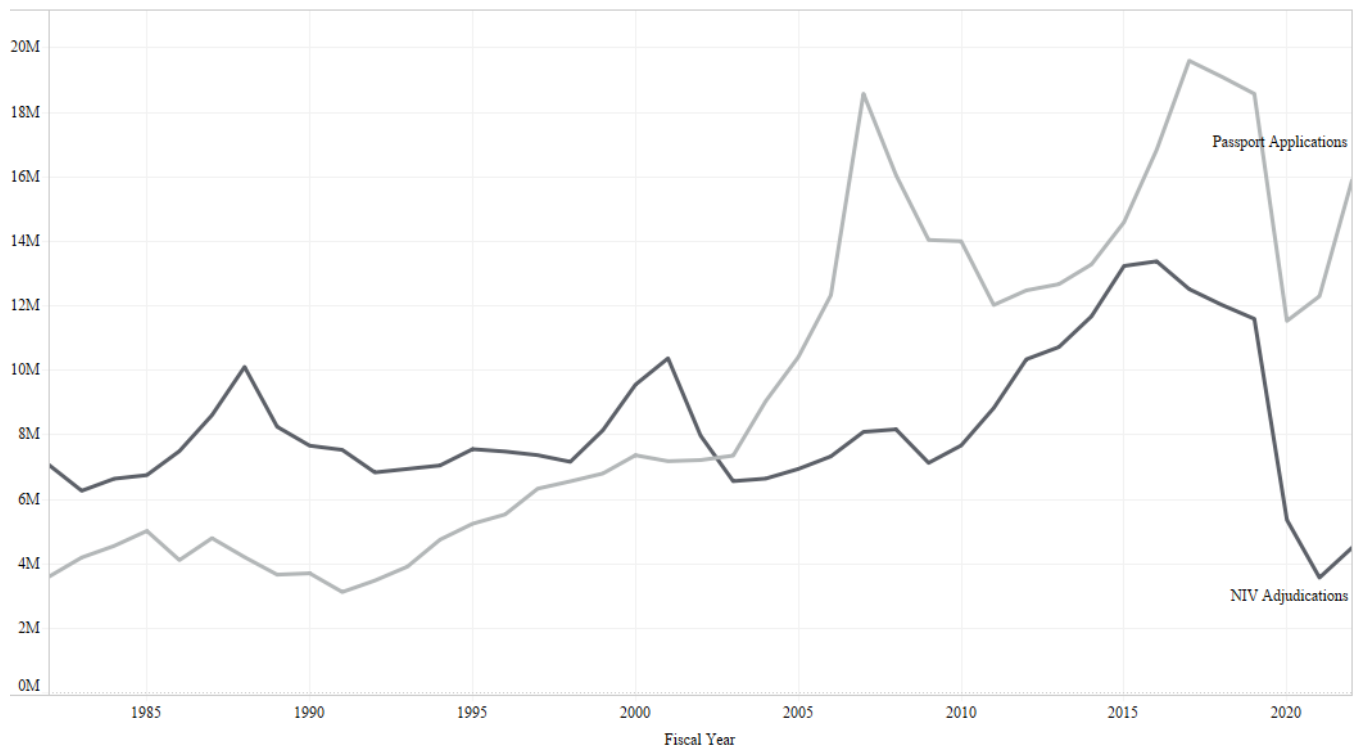
Passport Applications and Non-Immigrant Visa Adjudications FY 1981-2022

Passport demand, which is reliant upon the U.S. domestic economy, is projected to recover faster than NIV demand, which is historically driven by applications from Mexico, China, India, and Brazil. Demand for