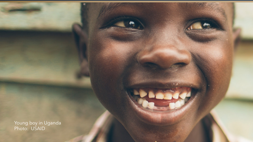
Young boy in Uganda

PEPFAR has supported 20 countries to achieve epidemic control of HIV and formed the backbone of the COVID-19 response in Africa